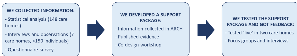
Figure 1. Flow diagram of main phases of ARCH

There were three main phases in the ARCH (Antibiotic Research in Care Homes) project, as shown in Figure 1.